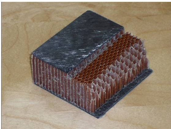
Cutaway of a test sample similar to a bulkhead showing Nomex sandwiched between layers of prepreg carbon fiber.

First the hull and deck core material will be primarily Nomex ® which is made from Kevlar ® in the form of a honeycomb. The Nomex ® material looks very much like corrugated cardboard. It is much lighter than the closed cell foam that has typically been used for custom boat construction.