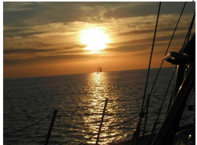
Chase is On...

Strangely, the race seemed to go by pretty quickly, and whether or not I was more focused because of my