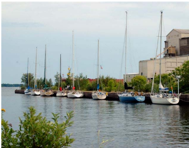
Slip Number Two in Duluth - Perfect for Listening to Jazzfest!

As the sun rose, wind started to return, but it wasn't steady and served to only rise, then dash hopes of a daytime finish in Duluth. Speeds of eight knots came and went, only to be replaced by indications of less than one,